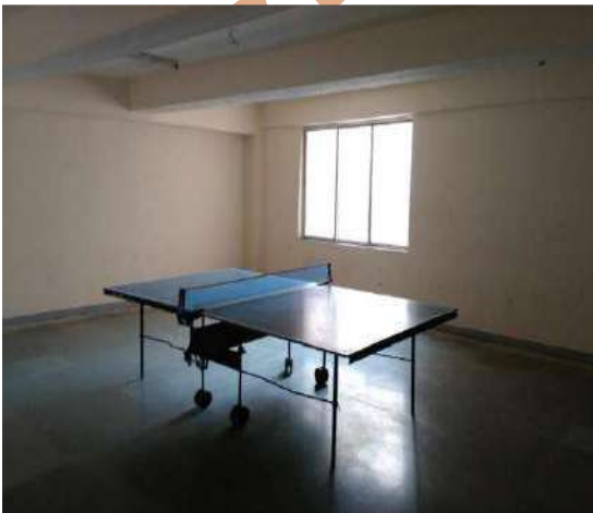
Indoor Sports Facility In Hostel