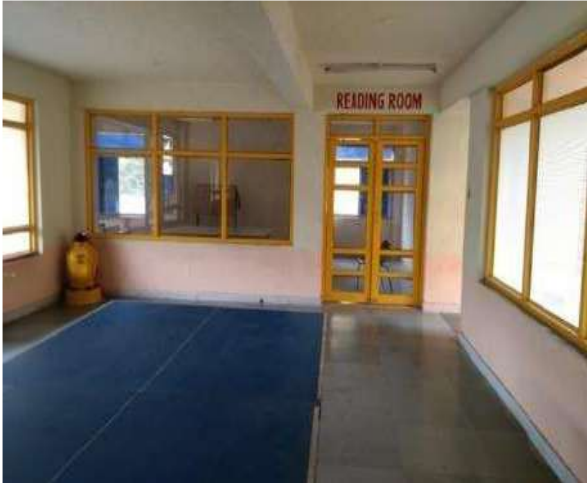
Reading Room In Hostel