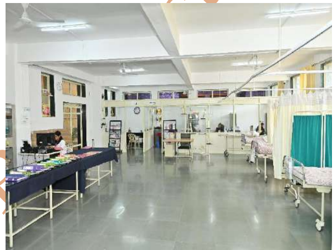
Adult Health Nursing Dept. and Advanced Nursing Lab.