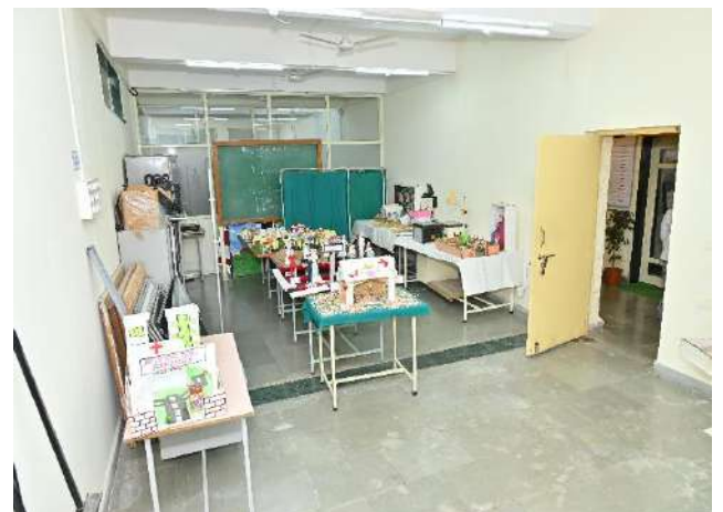
A.V. Aids Lab.