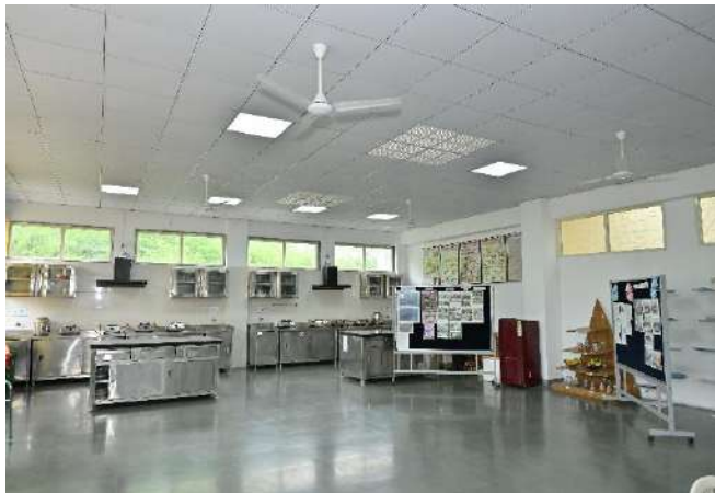
Community Health Nursing and Nutrition Lab.