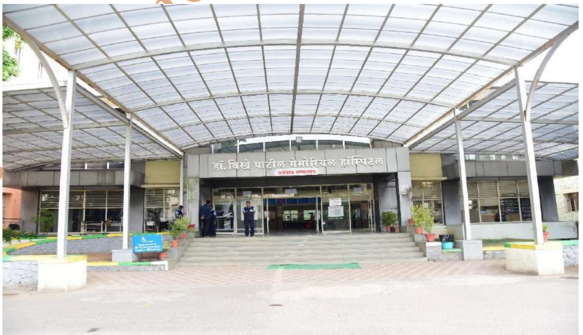
Dr. Vikhe Patil Memorial Hospital (800 Beds)