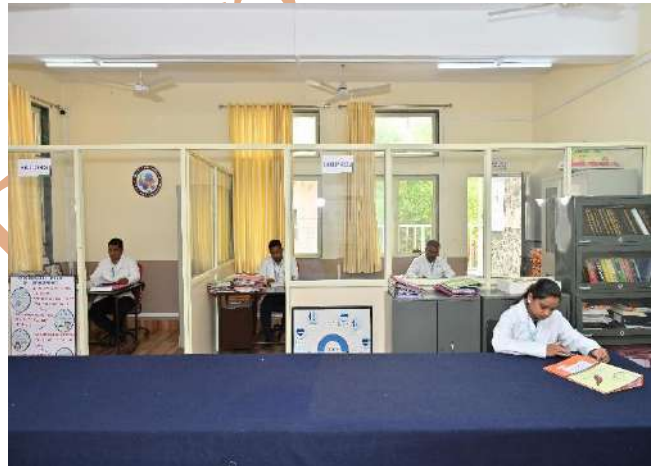
Mental Health Nursing Dept.